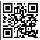
SPAY/NEUTER PACK RING COATED

Spay Packs Ring Coated is an advanced alternative to the least effective masking tape. Five different colors, i.e., Rainbow, Purple, Rose Gold, Black and Blue, make the identification easy for the surgeons. The bacteria remain intact with the instrument if it is taped. Therefore, this instrument can be sterilized to become highly efficient for reuse. This instrument requires low maintenance due to high tensile strength, and the coating will not peel off.