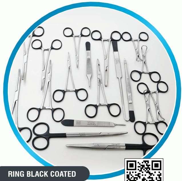
RING BLACK COATED