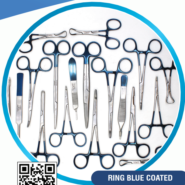
RING BLUE COATED