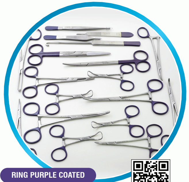
RING PURPLE COATED