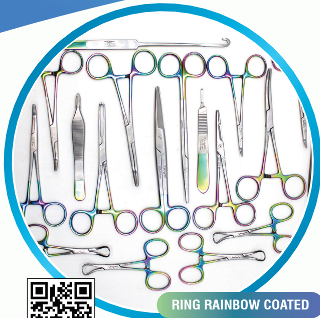
RING RAINBOW COATED