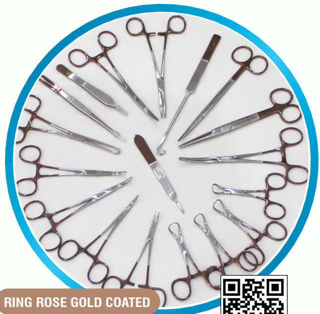
RING ROSE GOLD COATED

Spay Packs Ring Coated is an advanced alternative to the least effective masking tape. Five different colors, i.e., Rainbow, Purple, Rose Gold, Black and Blue, make the identification easy for the surgeons. The bacteria remain intact with the instrument if it is taped. Therefore, this instrument can be sterilized to become highly efficient for reuse. This instrument requires low maintenance due to high tensile strength, and the coating will not peel off.