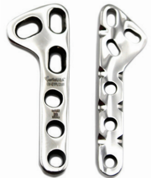
GV-STPLO-24R 2.4 Right