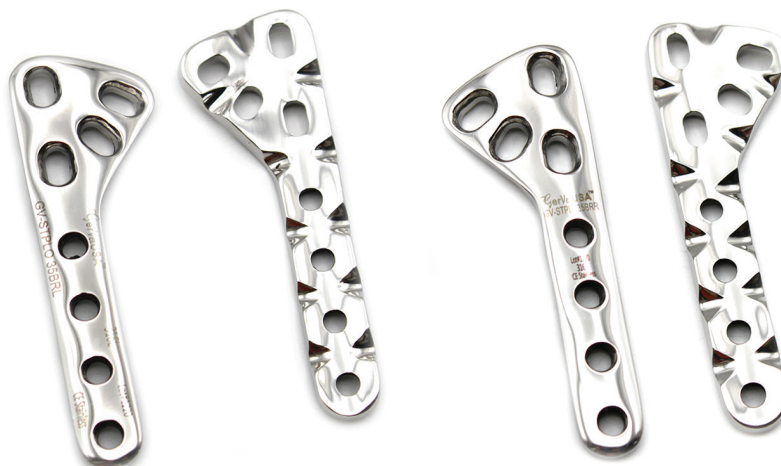
Plate 3.5 Broad Right