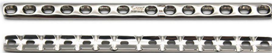
Plate 116mm Length 8mm Width 2.5mm Thickness 14 Holes