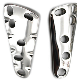
GV-TPLO DEL 27BR 2.7 Broad Right