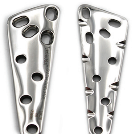
GV-TPLO-DEL35BR 3.5 Broad Right