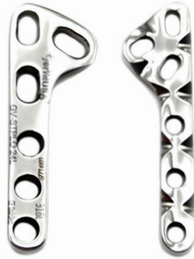
GV-STPLO-24L 2.4 Left