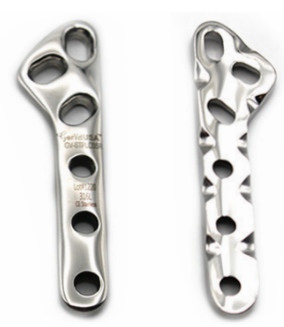
GV-STPLO 35R 3.5 Right