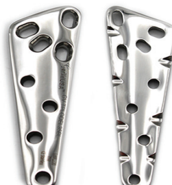
GV-TPLO-DEL35BL 3.5 Broad Left