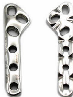
GV-STPLO 35L 3.5 Left