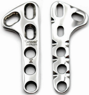
GV-STPLO-27L 2.7 Left