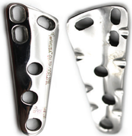
GV-TPLO DEL 27BL 2.7 Broad Left