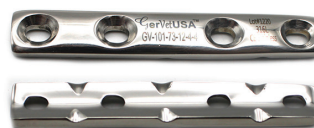
Plate 55mm Length 12mm Width 4mm Thickness 3 Holes